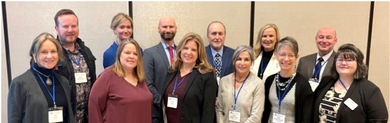
NASDAE Board of Directors at NTI in Atlanta, October 2022

Additionally, the Executive Director and Assistant Director are former State Directors of Adult Education.